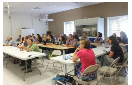
Over 50 educators attended the conference.