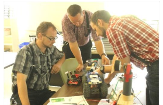
Attendees got the chance to try out robots firsthand after the Manitoba Robot Games presentation.