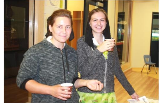
Breaks between sessions allowed teachers the opportunity to network, visit with friends, and discuss the previous sessions.